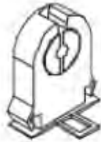
T8 Style lamp holders only available for 8 ft. kit

[1] Shunted lamp holders (L10) are suitable for instant start ballasts, un-shunted (L11) for rapid or pro start ballast