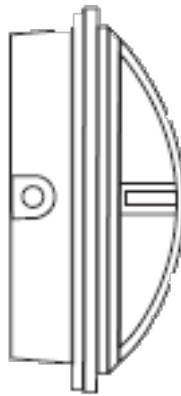
CF High Wattage - 6.21" to 6.46" (H)