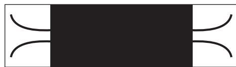
Inside the LVT

Load 50-150W Input 120V 60Hz Output at 150W 11.55V 120Hz Input current at 150W 1.25A Output current at 150W 12.56A Power factor 0.985 Max. harmonic distortion 12V <14.8% Dimmable