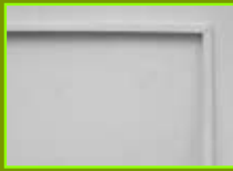
Flush steel door frame, white finish

Texas Fluorescents provides a full assortment of lens and door frame options. If you don't see it here, consult factory.