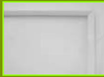
Regressed door frame, aluminum, white, or black finish