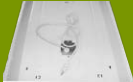
Factory installed cord sets are available in black, white, various lengths, and plug styles.