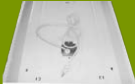
Factory installed cord sets are available in black, white, various lengths, and plug styles.