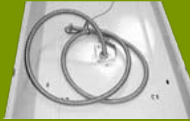
Whips: Flexible conduit, factory installed in access plate or EKO