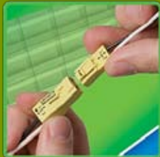
Disconnects may be added to any recessed fixture to meet National Electric Code (NEC) requirements.

Save time and money by having Texas Fluorescents wire the fixture to make installation easier and faster. Add these codes to the item number to specify.