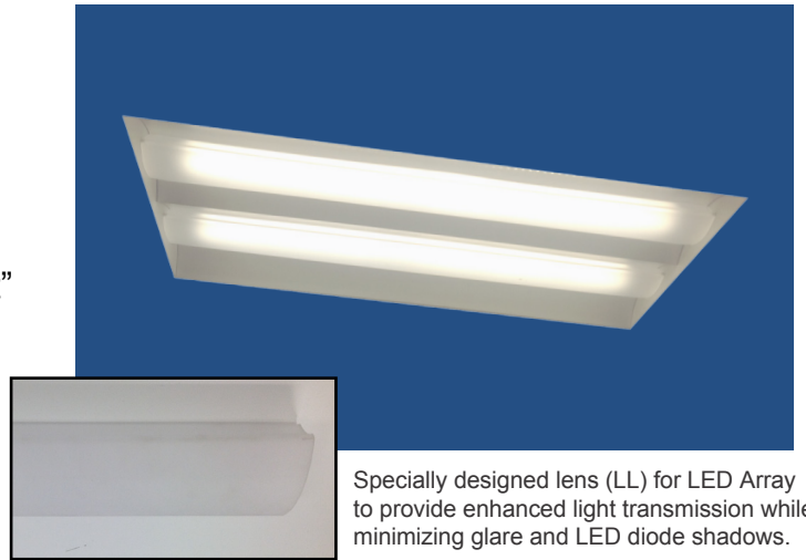
Specially designed lens (LL) for LED Array to provide enhanced light transmission while minimizing glare and LED diode shadows.